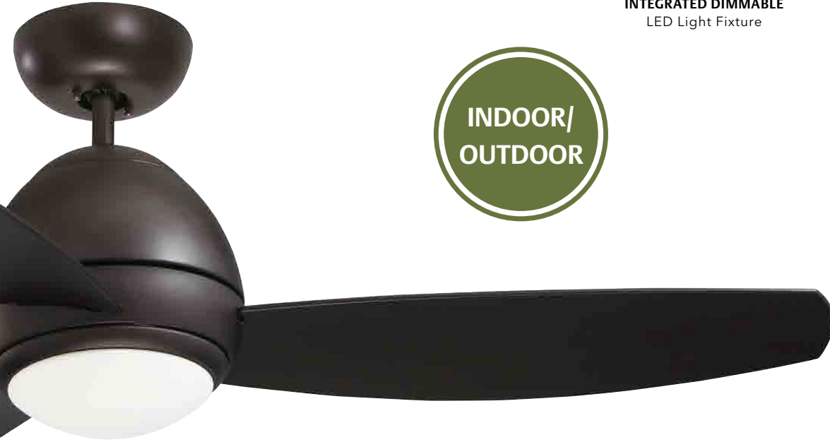
A. Shown in Oil Rubbed Bronze with Weather-Resistant Oil Rubbed Bronze Blades and Opal Matte Glass Shade