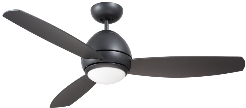
C. Shown in Graphite with Weather-Resistant Graphite Blades and Opal Matte Glass Shade