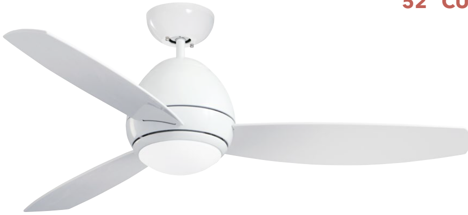
B. Shown in Appliance White with Weather-Resistant Appliance White Blades and Opal Matte Glass Shade