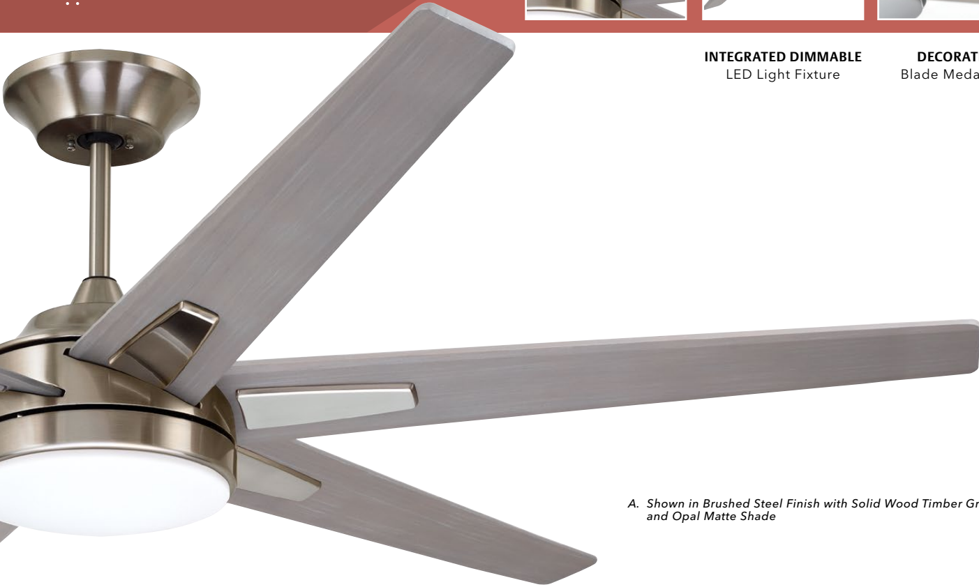
A. Shown in Brushed Steel Finish with Solid Wood Timber Gray Blades and Opal Matte Shade