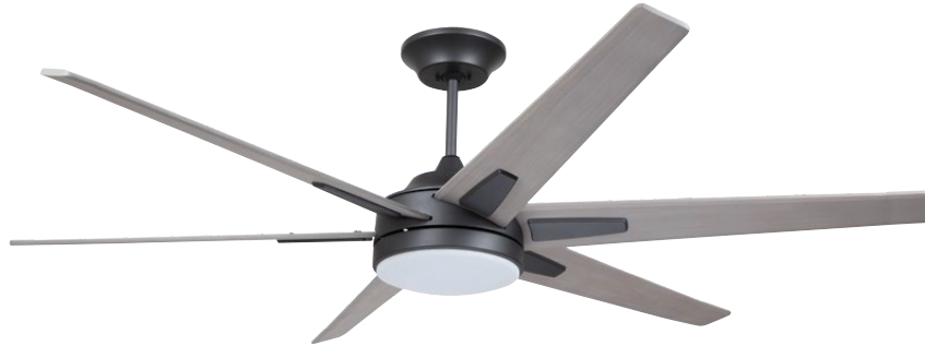
C. Shown in Graphite with Solid Wood Timber Gray Blades and Opal Matte Shade