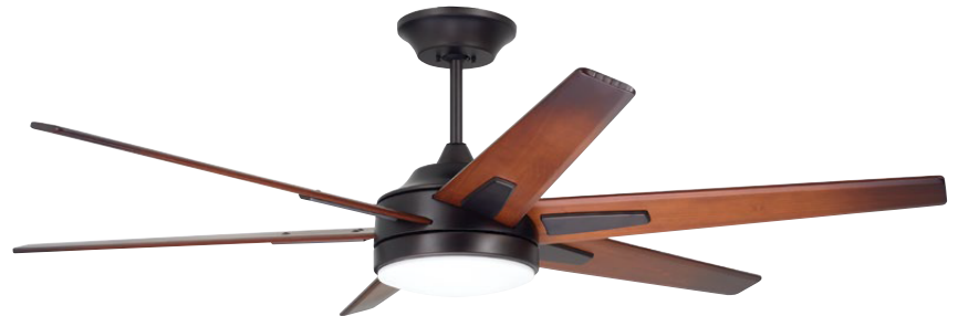
D. Shown in Oil Rubbed Bronze with Solid Wood Sunburst Walnut Blades and Opal Matte Shade

SHIPPING SPECIFICATIONS: Carton Weight: 20.00 LBS | Length: 25.00" | Width: 17.00" | Depth: 12.00"