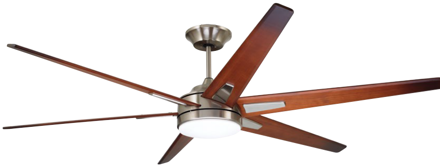
B. Shown in Brushed Steel with Solid Wood Sunburst Walnut Blades and Opal Matte Shade