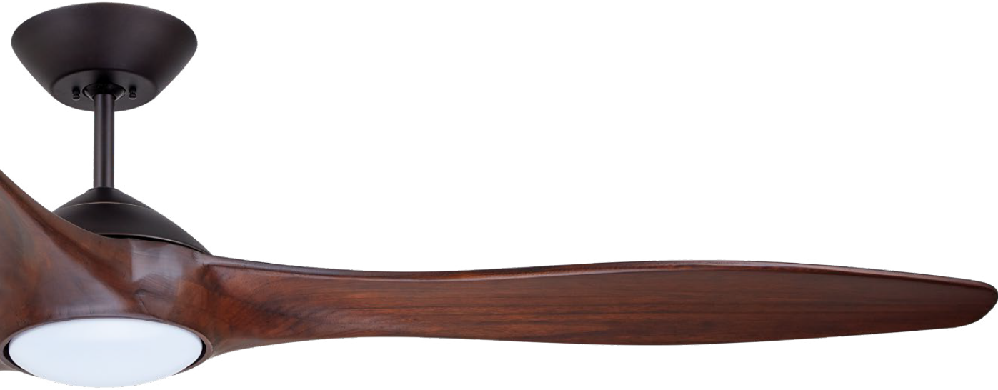
E. Shown in Oil Rubbed Bronze with Sculpted Solid Wood Coffee Blades and Opal Matte Shade