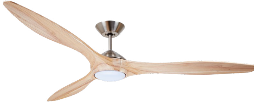
G. Shown in Brushed Steel with Sculpted Solid Wood Natural Blades and Opal Matte Shade