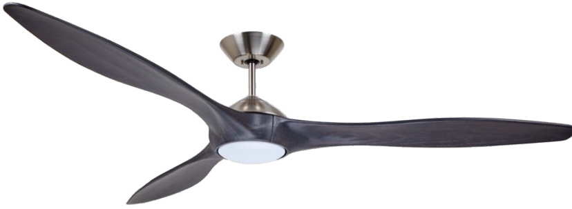
F. Shown in Brushed Steel with Sculpted Solid Wood Charcoal Blades and Opal Matte Shade