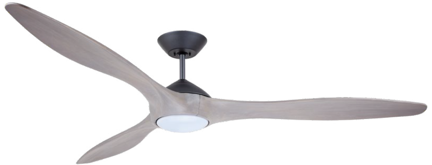
H. Shown in Graphite with Sculpted Solid Wood Timber Gray Blades and Opal Matte Shade

SHIPPING SPECIFICATIONS: Carton Weight: 22.60 LBS | Length: 36.25" | Width: 19.00" | Depth: 10.00"