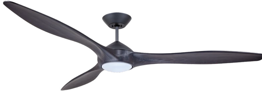
C. Shown in Graphite with Sculpted Solid Wood Charcoal Blades and Opal Matte Shade