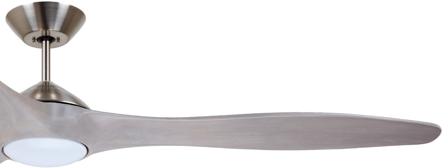
A. Shown in Brushed Steel with Sculpted Solid Wood Timber Gray Blades and Opal Matte Shade