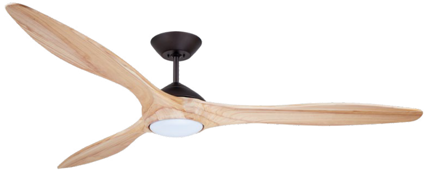
D. Shown in Oil Rubbed Bronze with Sculpted Solid Wood Natural Blades and Opal Matte Shade