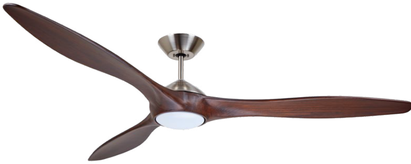
B. Shown in Brushed Steel with Sculpted Solid Wood Coffee Blades and Opal Matte Shade