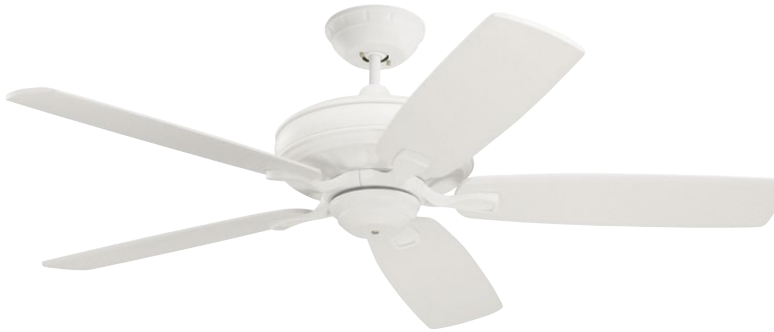
F. Shown in Satin White with 22" Solid Wood Satin White Blades (B77SW)