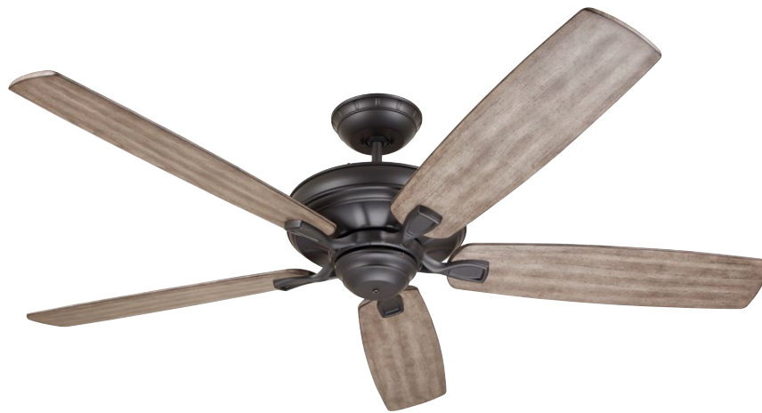
G. Shown in Graphite with 22" Solid Wood Smokey Gray Blades (B78SMG)