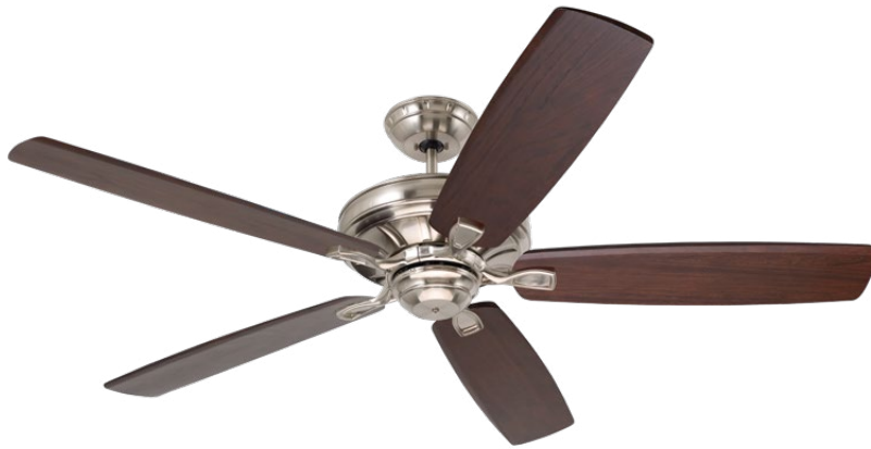
B. Shown in Brushed Steel with 25" Coffee Blades (B78CO)