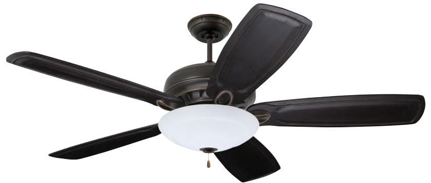
D. Shown in Golden Espresso with 25" Carved Hardwood Classic Vintage Black Blades (B90VBL) and Riley Light Fixture (LK180)