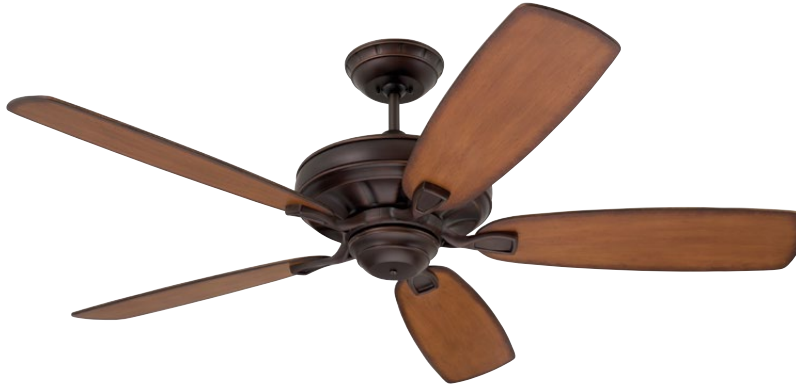
C. Shown in Venetian Bronze with 22" Honey Oak Blades (G54HO)