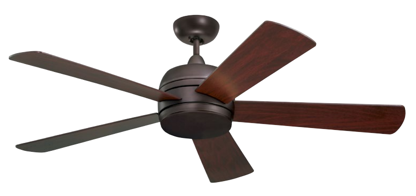
C. Shown in Oil Rubbed Bronze with Mahogany Blades and No-Light Plate (CP930ORB)

B. Shown in Appliance White with Appliance White Blades and Opal Matte Glass Shade