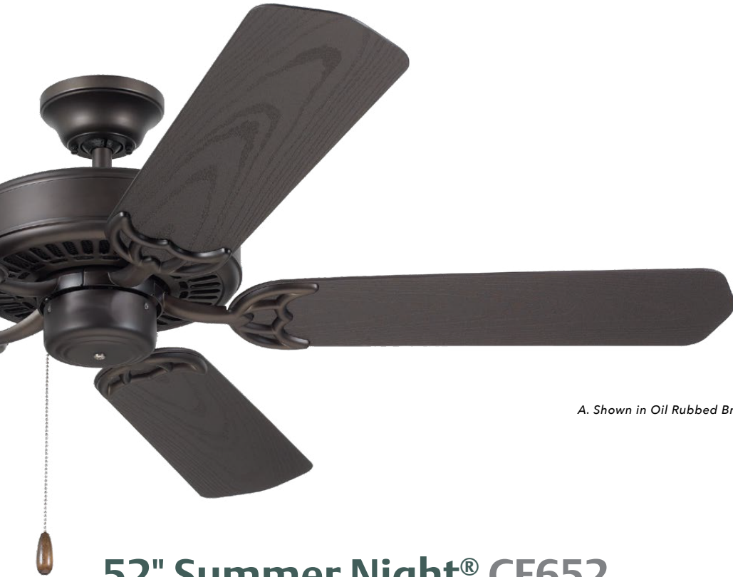
A. Shown in Oil Rubbed Bronze with Weather-Resistant Oil Rubbed Bronze Blades