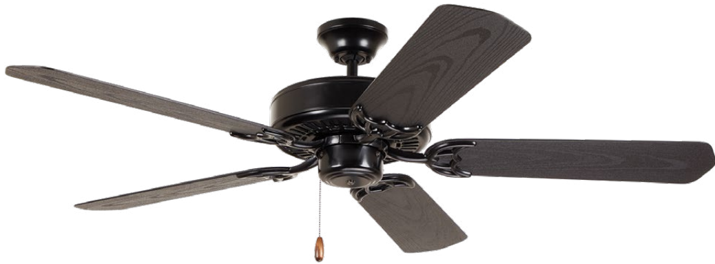
C. Shown in Barbeque Black with Barbeque Black Blades