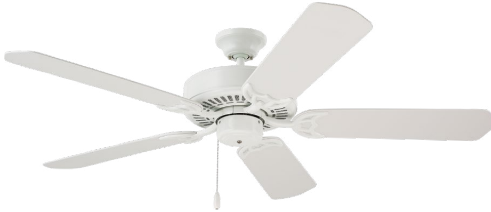
B. Shown in Appliance White with Weather-Resistant Appliance White Blades