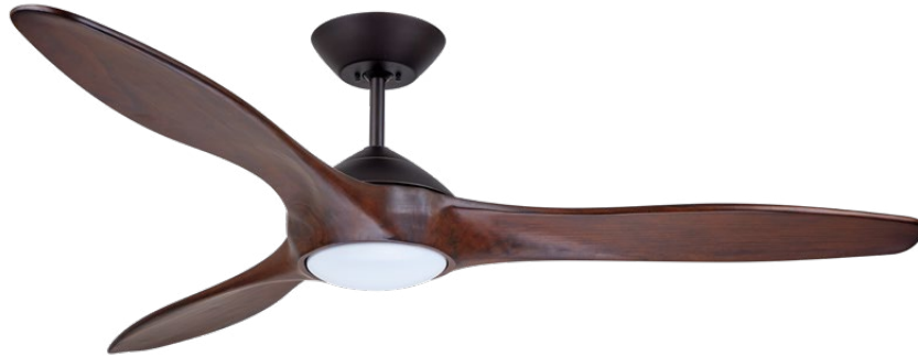
G. Shown in Oil Rubbed Bronze with Sculpted Solid Wood Coffee Blades and Opal Matte Shade

E. 60" LINDBERGH ECO – BRUSHED STEEL CF315NA60BS - Sculpted Solid Wood Natural Blades, Opal Matte Shade