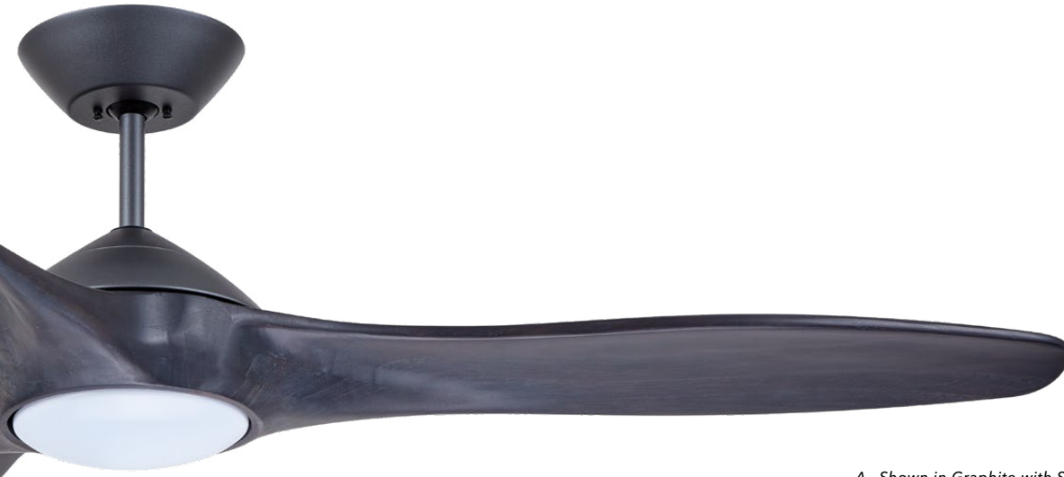
A. Shown in Graphite with Sculpted Solid Wood Charcoal Blades and Opal Matte Shade