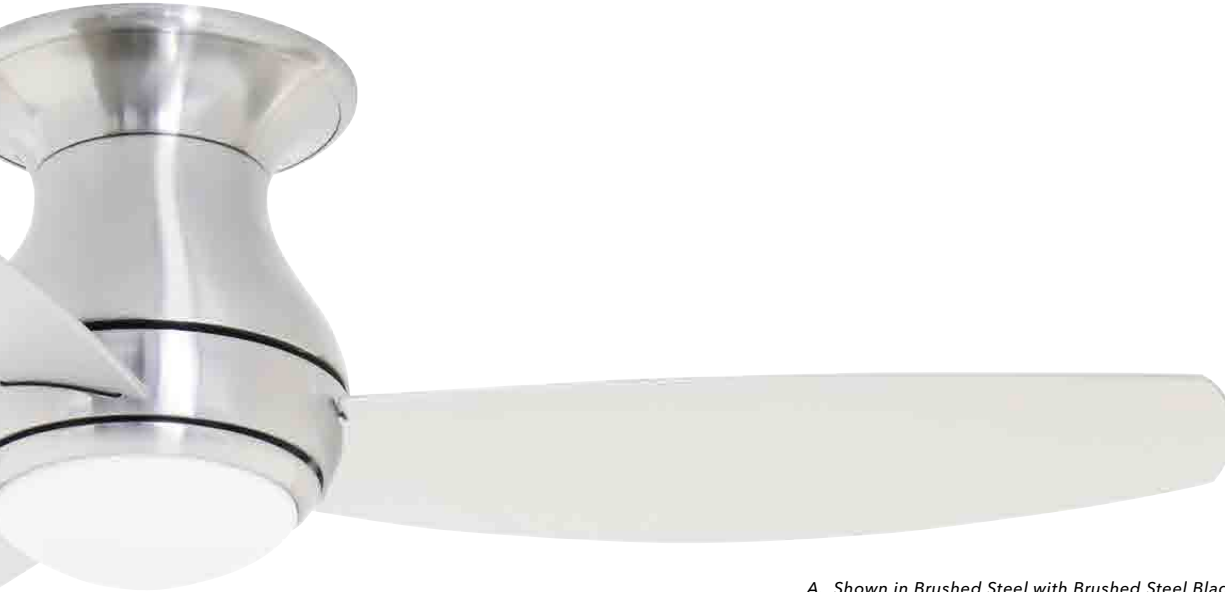
A. Shown in Brushed Steel with Brushed Steel Blades and Opal Matte Glass Shade