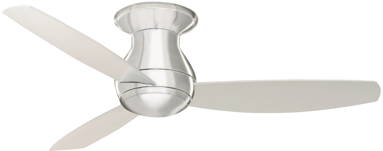
A. Shown in Brushed Steel with Brushed Steel Blades and No-Light Option

A. 52" CURVA™ SKY LED INDOOR – BRUSHED STEEL CF153LBS - Brushed Steel Blades, Opal Matte Glass Shade