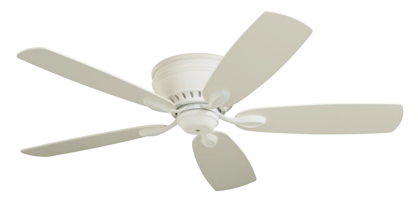
C. Shown in Satin White with Satin White Blades

B. Shown in Venetian Bronze with Walnut Blades