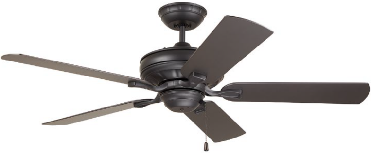
E. Shown in Graphite with Graphite Blades

E. 52" VERANDA – GRAPHITE CF552GRT - Graphite Blades