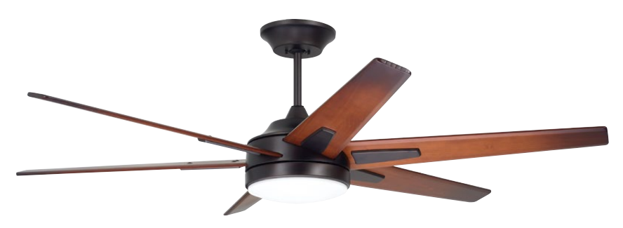
D. Shown in Oil Rubbed Bronze with Solid Wood Sunburst Walnut Blades and Opal Matte Shade

D. 60" RAH ECO – OIL RUBBED BRONZE CF915W60ORB - Solid Wood Sunburst Walnut Blades, Opal Matte Shade