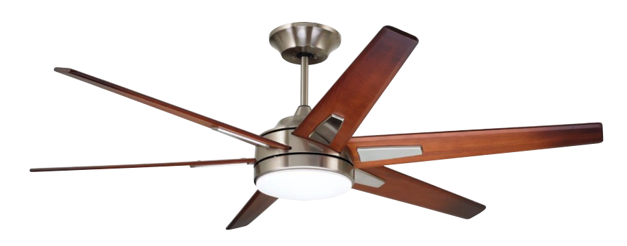
C. Shown in Brushed Steel with Solid Wood Sunburst Walnut Blades and Opal Matte Shade

B. Shown in Brushed Steel Finish with Solid Wood Timber Gray Blades and Opal Matte Shade