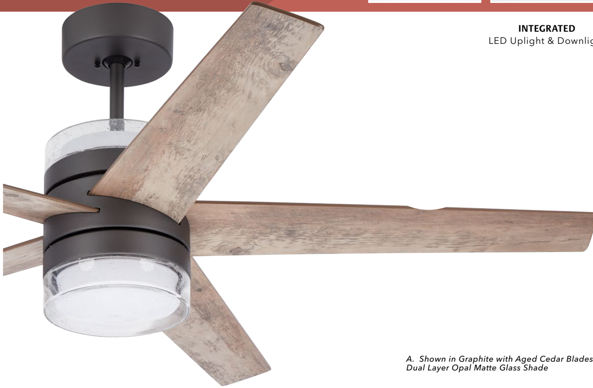
A. Shown in Graphite with Aged Cedar Blades and Dual Layer Opal Matte Glass Shade