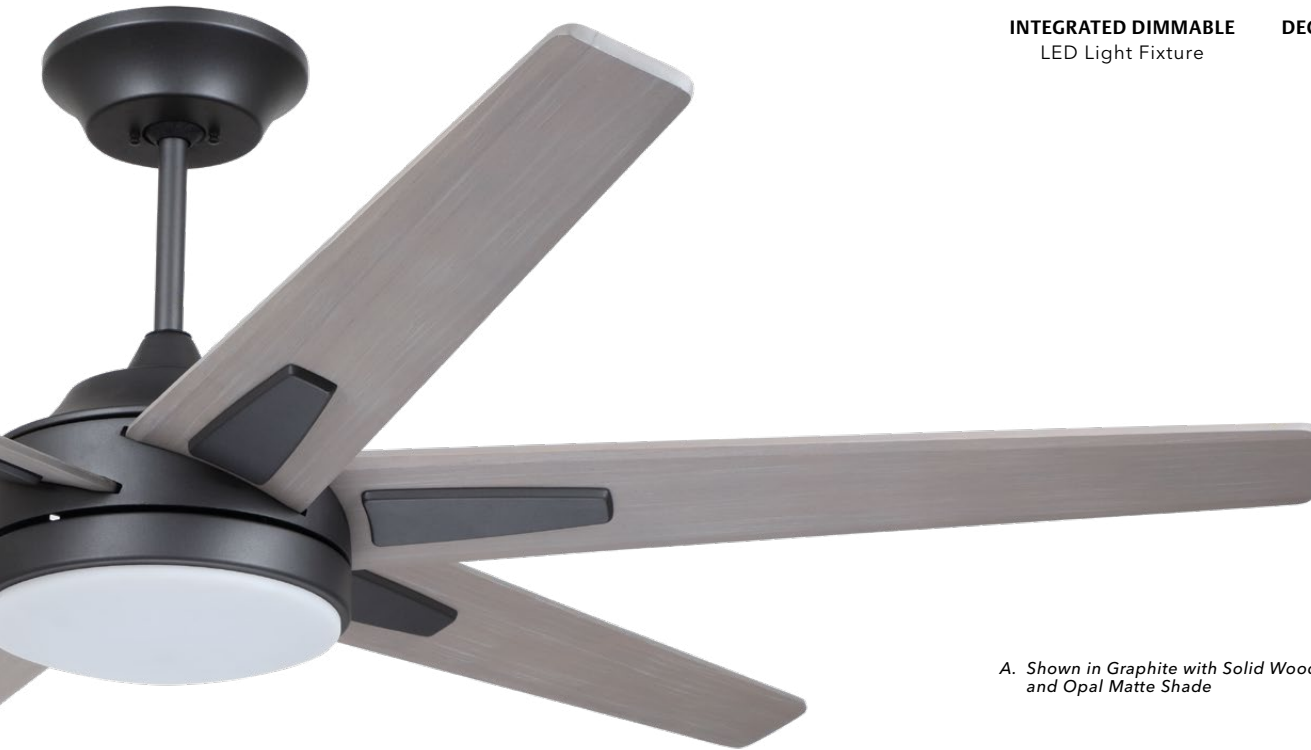
A. Shown in Graphite with Solid Wood Timber Gray Blades and Opal Matte Shade