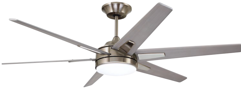
B. Shown in Brushed Steel Finish with Solid Wood Timber Gray Blades and Opal Matte Shade