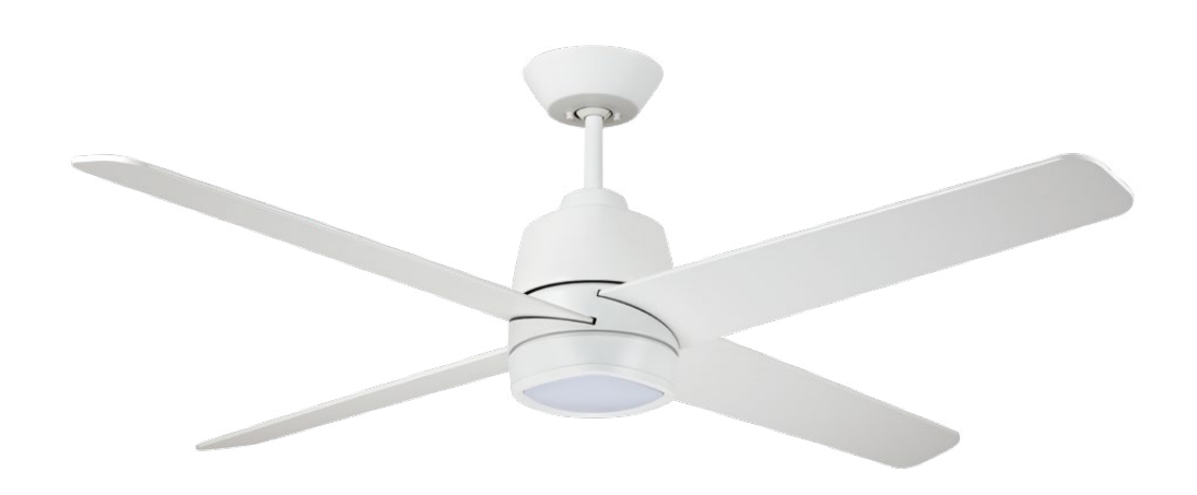
C. Shown in Satin White with Satin White Blades and Opal Matte Shade

B. Shown in Barbeque Black with Polished Nickel Accents, Barbeque Black Blades and Opal Matte Shade