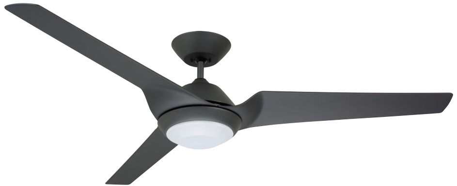
D. Shown in Graphite Finish with Graphite Blades and Opal Matte Shade