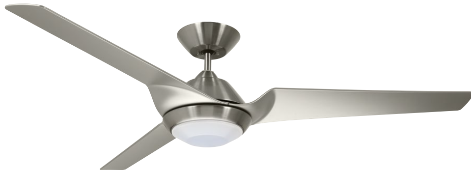
C. Shown in Brushed Steel Finish with Brushed Steel Blades and Opal Matte Shade