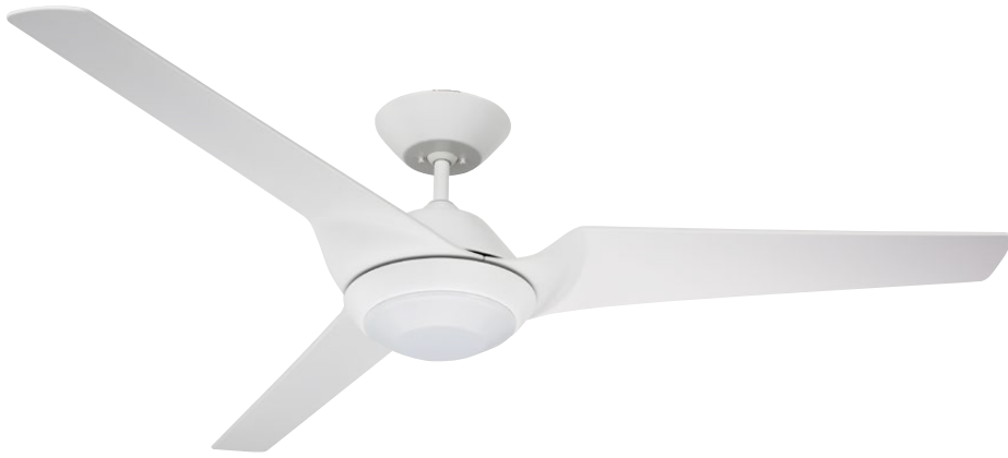
B. Shown in Satin White Finish with Satin White Blades and Opal Matte Shade