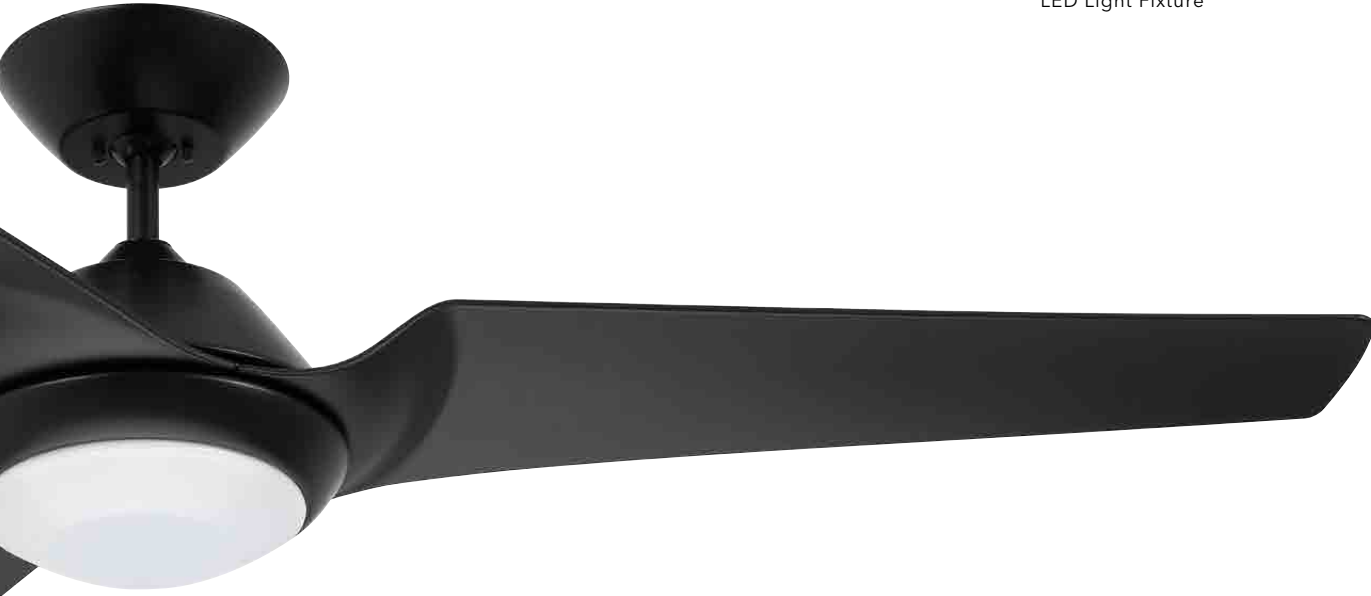
A. Shown in Barbeque Black Finish with Barbeque Black Blades and Opal Matte Shade