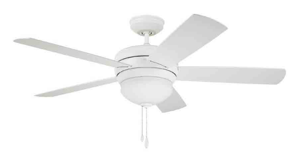
B. Shown in Satin White with Satin White Blades and Opal Matte Shade