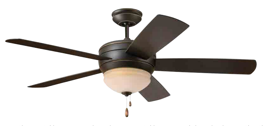
B. Shown in Golden Espresso with Weather-Resistant Golden Espresso Blades and Amber Mist Glass Shade