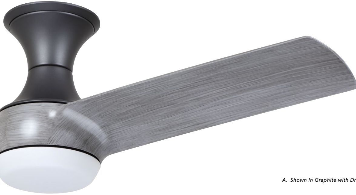
A. Shown in Graphite with Driftwood Blades and Opal Matte Shade