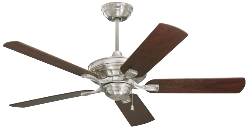
D. 52" BELLA – BRUSHED STEEL CF452BS - Dark Cherry/Walnut Blades