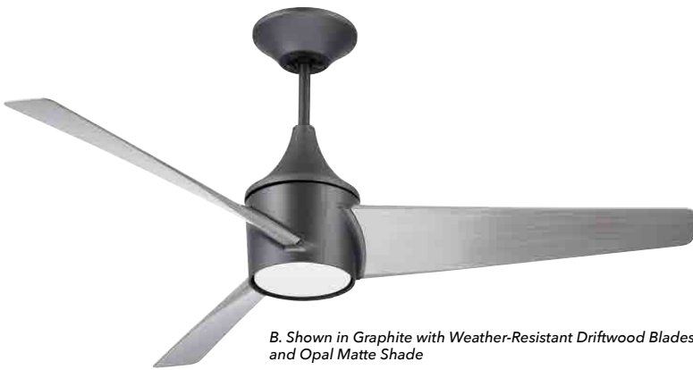
B. Shown in Graphite with Weather-Resistant Driftwood Blades and Opal Matte Shade