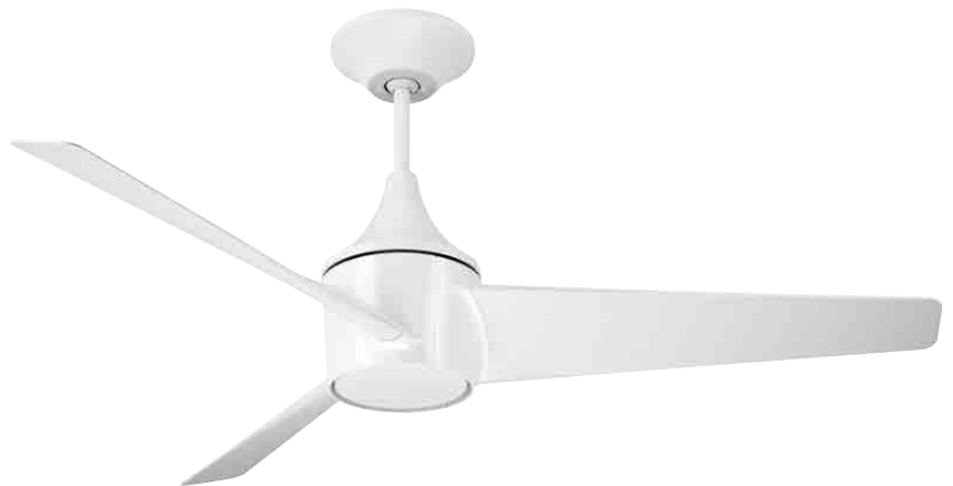
E. Shown in Satin White with Weather-Resistant Satin White Blades and Opal Matte Shade

SHIPPING SPECIFICATIONS: Carton Weight: 22.71 LBS | Length: 24.7" | Width: 14.80" | Depth: 12.00"