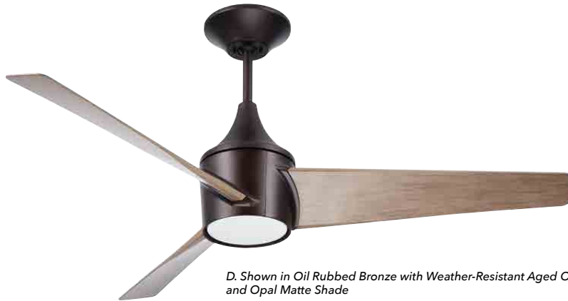
D. Shown in Oil Rubbed Bronze with Weather-Resistant Aged Oak Blades and Opal Matte Shade