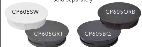
OPTIONAL No-Light Plates