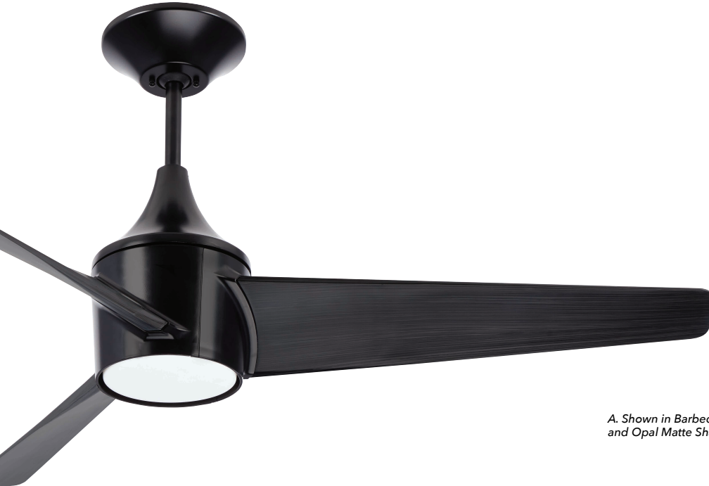
A. Shown in Barbeque Black with Weather-Resistant Charcoal Blades and Opal Matte Shade