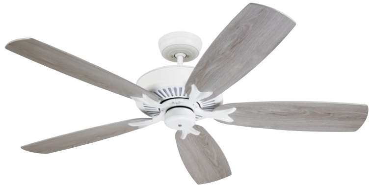
D. Shown in Satin White with Timber Gray Blades (G54TM)

SHIPPING SPECIFICATIONS: Carton Weight: 18.60 LBS | Length: 14.50" | Width: 14.50" | Depth: 13.25"