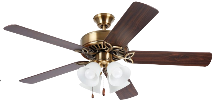
D. 50" PRO SERIES II – ANTIQUE BRASS CF711AB - Walnut/Medium Oak Blades, Opal Matte Glass Shades