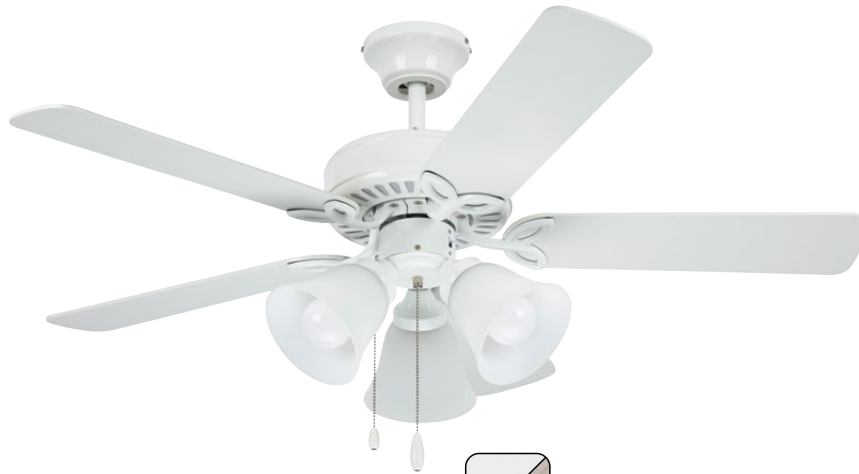
C. Shown in Appliance White with Appliance White Blades and Opal Matte Glass Shades