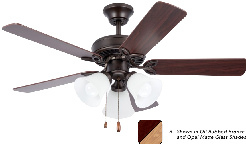
B. Shown in Oil Rubbed Bronze with Dark Cherry Blades and Opal Matte Glass Shades