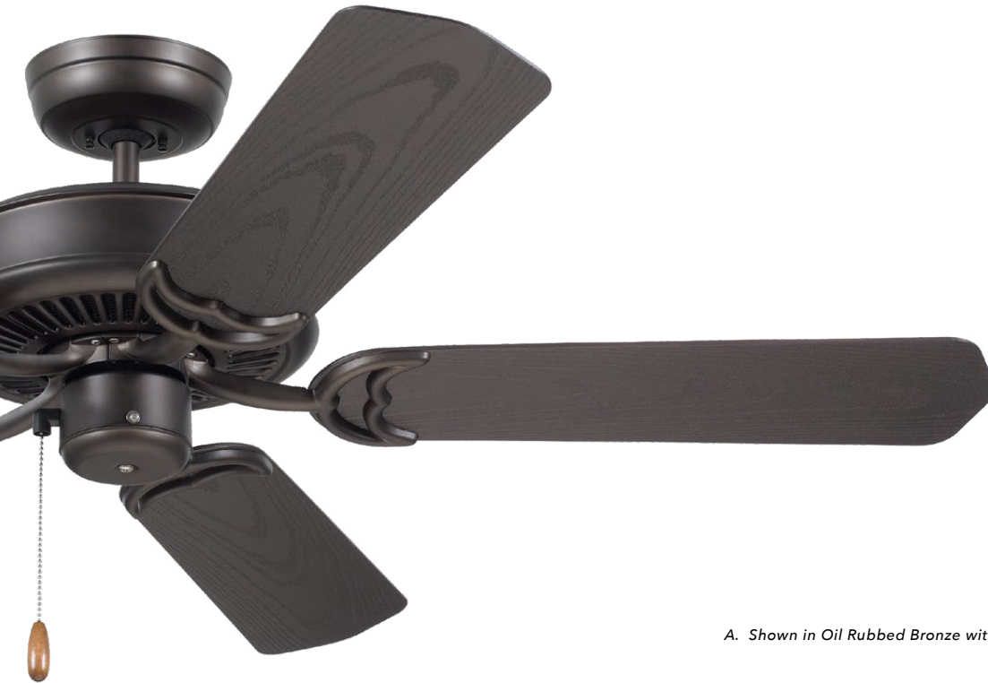
A. Shown in Oil Rubbed Bronze with Weather-Resistant Oil Rubbed Bronze Blades