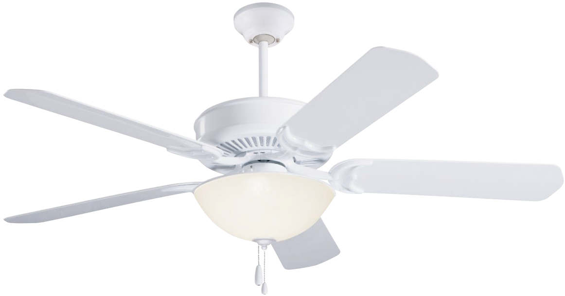
B. Shown in Appliance White with Weather-Resistant Appliance White Blades and Opal Matte Light Fixture (LK81WW) with Wet Location Plate (WLP100WW)