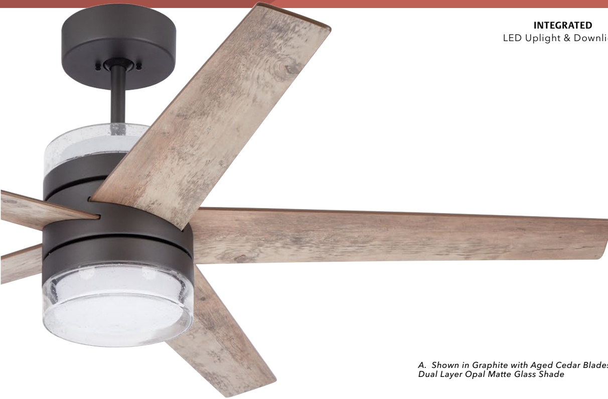
A. Shown in Graphite with Aged Cedar Blades and Dual Layer Opal Matte Glass Shade