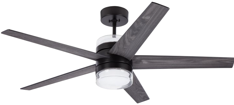
B. Shown in Barbeque Black with Charcoal Blades and Dual Layer Opal Matte Glass Shade