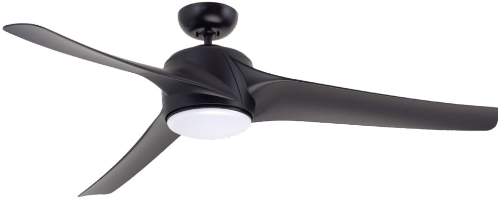
B. Shown in Barbeque Black with Weather-Resistant Barbeque Black Blades and Opal Matte Shade