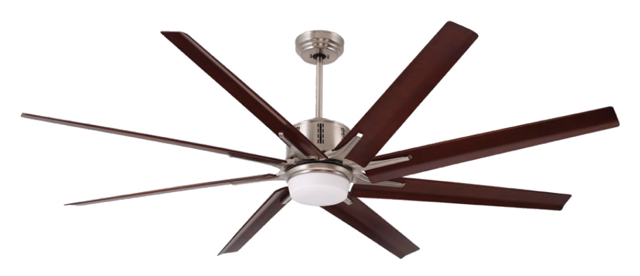
C. Shown in Brushed Steel with Walnut Blades and Opal Matte Glass

B. Shown in Oil Rubbed Bronze with Weather-Resistant Walnut Blades and Opal Matte Glass