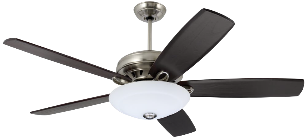
F. Shown in Brushed Steel with 25" Solid Wood Dark Mahogany Blades (B78DM) and Riley Light Fixture (LK180BS)