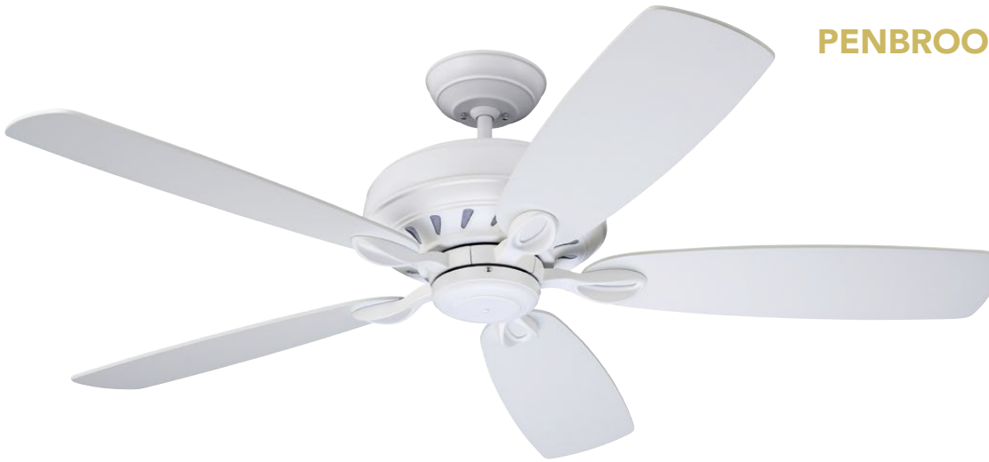
E. Shown in Satin White with 22" Satin White Blades (B77SW)