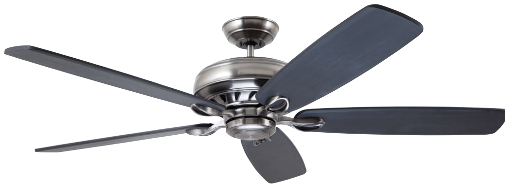
B. Shown in Antique Pewter with 22" Charcoal Blades (B78CR)