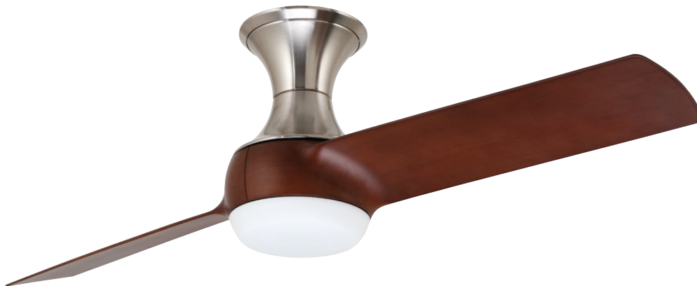
B. Shown in Brushed Steel with Walnut Blades and Opal Matte Shade