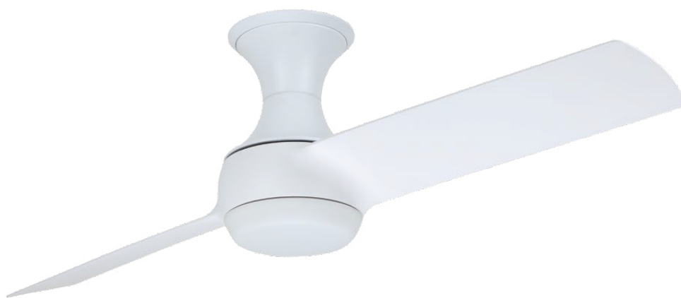
C. Shown in Satin White with Satin White Blades and Opal Matte Shade