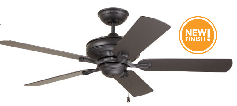
E. Shown in Graphite with Graphite Blades

SHIPPING SPECIFICATIONS: Carton Weight: 23.00 LBS | Length: 20.75" | Width: 13.25" | Depth: 11.0"