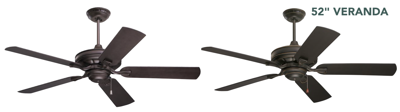
B. Shown in Oil Rubbed Bronze with Weather-Resistant Oil Rubbed Bronze Blades