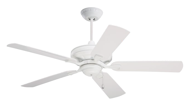
D. Shown in Satin White with Weather-Resistant Satin White Blades

A. 52" VERANDA – VINTAGE STEEL CF552VS - Weather-Resistant Chocolate Blades