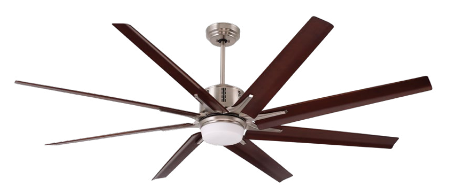
C. Shown in Brushed Steel with Walnut Blades and Opal Matte Glass

B. Shown in Oil Rubbed Bronze with Weather-Resistant Walnut Blades and Opal Matte Glass