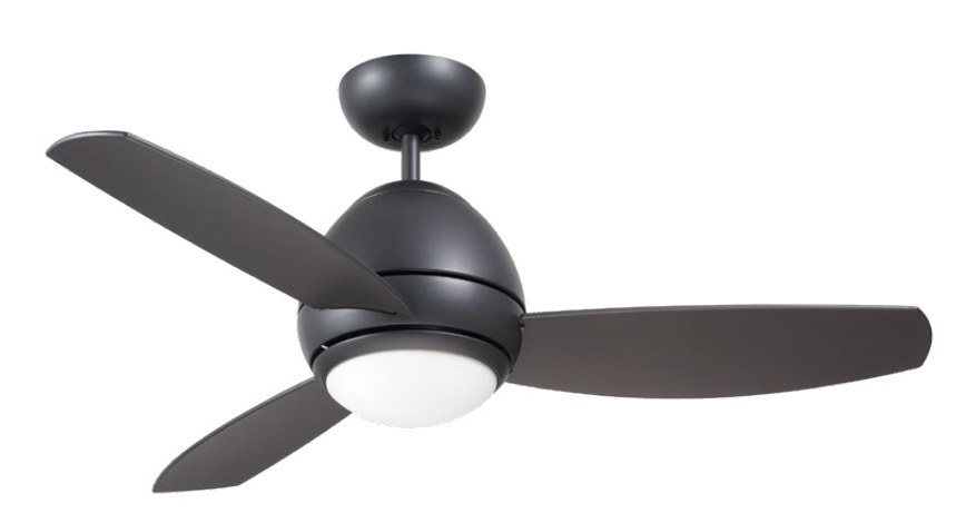
C. Shown in Graphite with Weather-Resistant Graphite Blades and Opal Matte Glass Shade

B. Shown in Appliance White with Weather-Resistant Appliance White Blades and Opal Matte Glass Shade