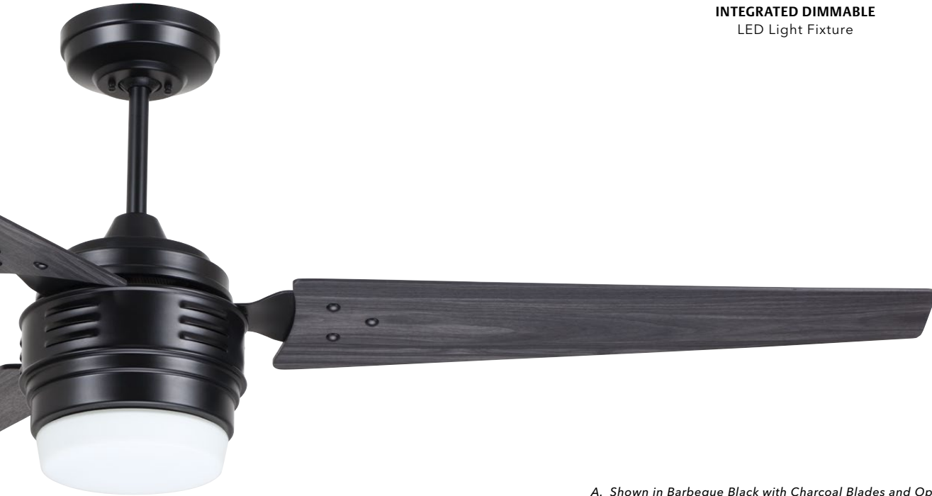
A. Shown in Barbeque Black with Charcoal Blades and Opal Matte Glass Shade