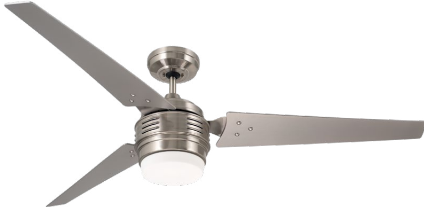
C. Shown in Brushed Steel with Brushed Steel Blades and Opal Matte Glass Shade