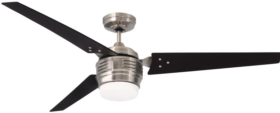
B. Shown in Brushed Steel with Chocolate Blades and Opal Matte Glass Shade