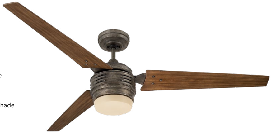
D. Shown in Vintage Steel with Riverwash Blades and Vintage Cream Glass Shade